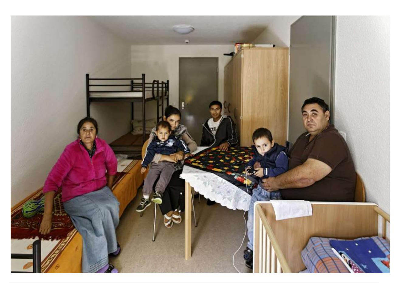
Syrische Familie im August 2014 in der Flüchtlingsunterkunft in Stuttgart-Plieningen. http://www.kontextwochenzeitung.de/debatte/256/rufer-in-der-wueste-3468.html

For sure the family in the picture above had completely another fantasy of living in Germany before coming here. It is not about the largeness of the room or the luxury but it is about a soft kind of "white torture" that the dwellers of these tasteless dormitories are experiencing everyday: Living inside a historically empty space implanted inside a city strongly doped with a foreign history and culture. This everyday contrast nonverbally communicates the gap: A visible distinction that marks their body as non-body or nobody if you like, in that exact way that these bodies are supposed to rest inside a non-place. It is through this gap that the radicalization as a death-culture takes chance to enter: "Come into our house!" "Be our guest for a while!" "We are all brothers!" … This calculated fraternity mediates a new promised placelessness that